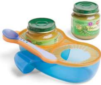
The Perfect Feeder